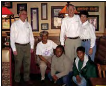
Above, EVB employees volunteer for a Relay for Life breakfast fundraiser at Applebee's in Tappahannock.

Co-Chair for Essex, Richmond County. "We had bake sales, fundraising dinners, concession stands. One office even held a golf tournament."